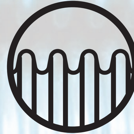
Open Pitch Corrugated Flexible Metal Hose (AGA)